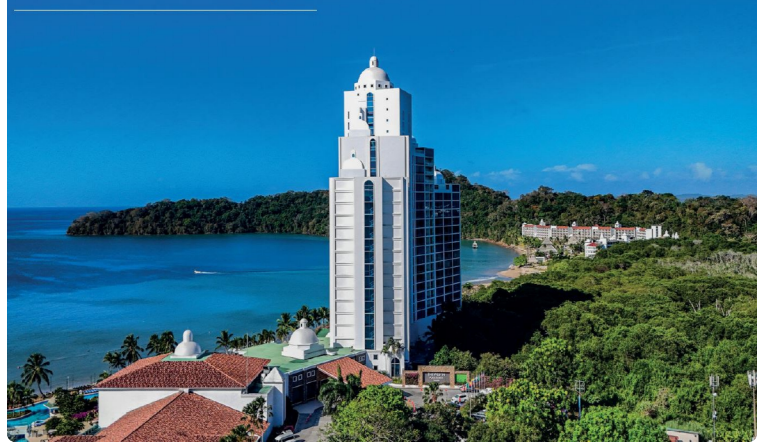
View desde el nivel 1400