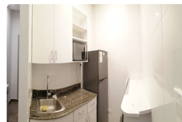
Property photo 3